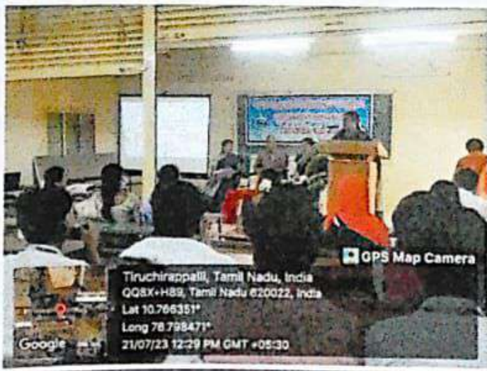
Tiruchirappalli, Tamil Nadu, India QQ5X+H89, Tamil Nadu 620022, India Lat 10.766351° Long 78.798471° 21/07/23 12:29 PM GMT +05:30