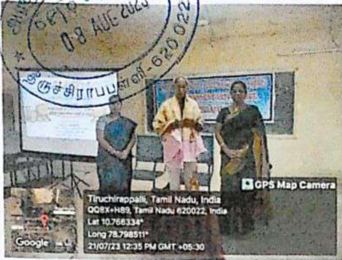
Tiruchirappalli, Tamil Nadu, India QQ5X+H89, Tamil Nadu 620022, India Lat 10.766334° Long 78.798511° 21/07/23 12:35 PM GMT +05:30