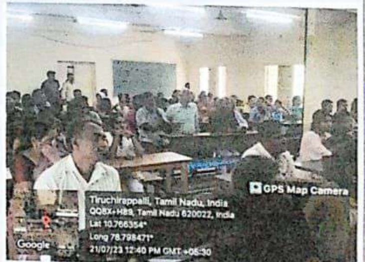
Tiruchirappalli, Tamil Nadu, India QQ5X+H89, Tamil Nadu 620022, India Lat 10.766354° Long 78.798471° 21/07/23 12:40 PM GMT +05:30