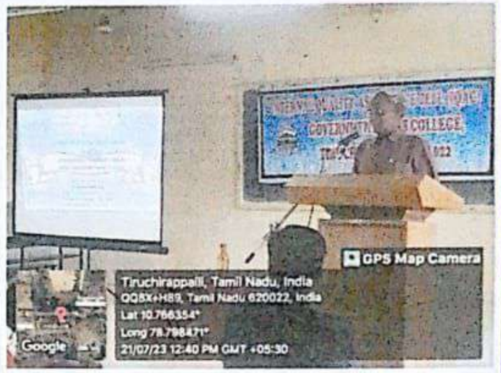
Tiruchirappalli, Tamil Nadu, India QQ5X+H89, Tamil Nadu 620022, India Lat 10.766354° Long 78.798471° 21/07/23 12:40 PM GMT +05:30