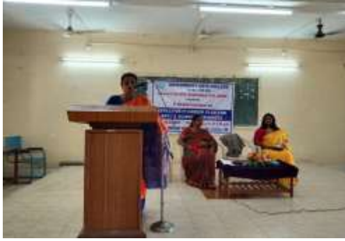
Presidential Address by the Principal