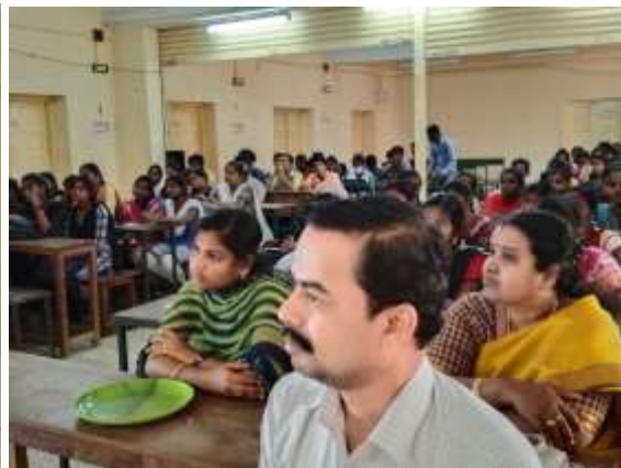
IQAC Members with the student participants

More than 365 students listened to the lecture. The invitee clarified their doubts and tried to remove the apprehensions in their minds about the IT field and encouraged them to the bright career opportunities in IT field for the young graduates.