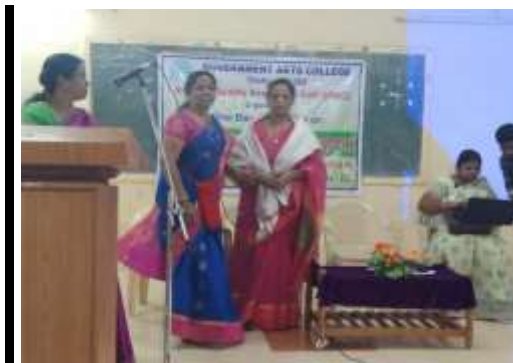
The Principal being honoured