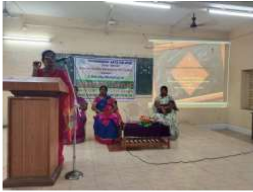
The Principal inaugurating the Workshop