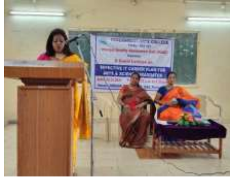
The invitee delivering the Guest Lecture