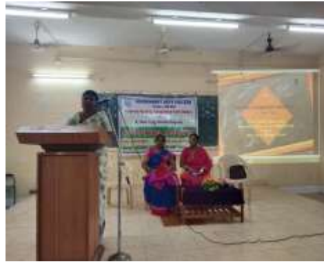
The Resource Person handling the Session